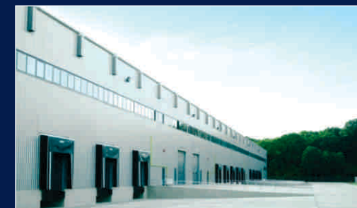
GOYAL BUILDER LOGISTIC PARK - BANUR - TEPLA ROAD