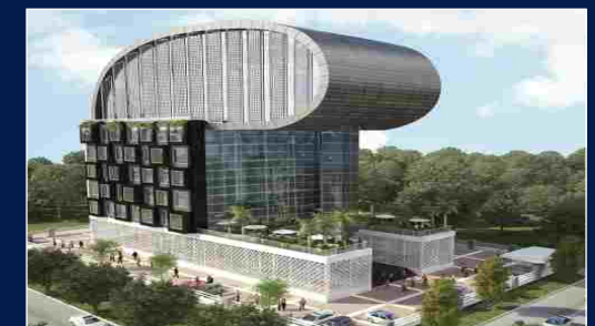
GRAPHENE IT BUILDING